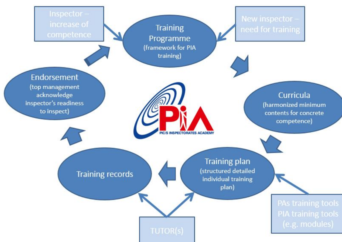
Outline of PIA Training Cycle

The PIA Training Programme aims to define harmonised minimum training requirements and its related curricula to define the scope of training for concrete inspector’s competence in specific fields (e.g. API, sterile, biologicals, etc.). The architecture clarifies the roles and delimits the responsibilities between the PIA, PIC/S Participating Authorities (including Tutors) and Trainees. Training will be based on high quality training materials focused on GMP requirements and inspection skills, to be delivered through various formats. The formats are to be provided either through training tools offered by PIA or by the PIC/S Participating Authorities or both.